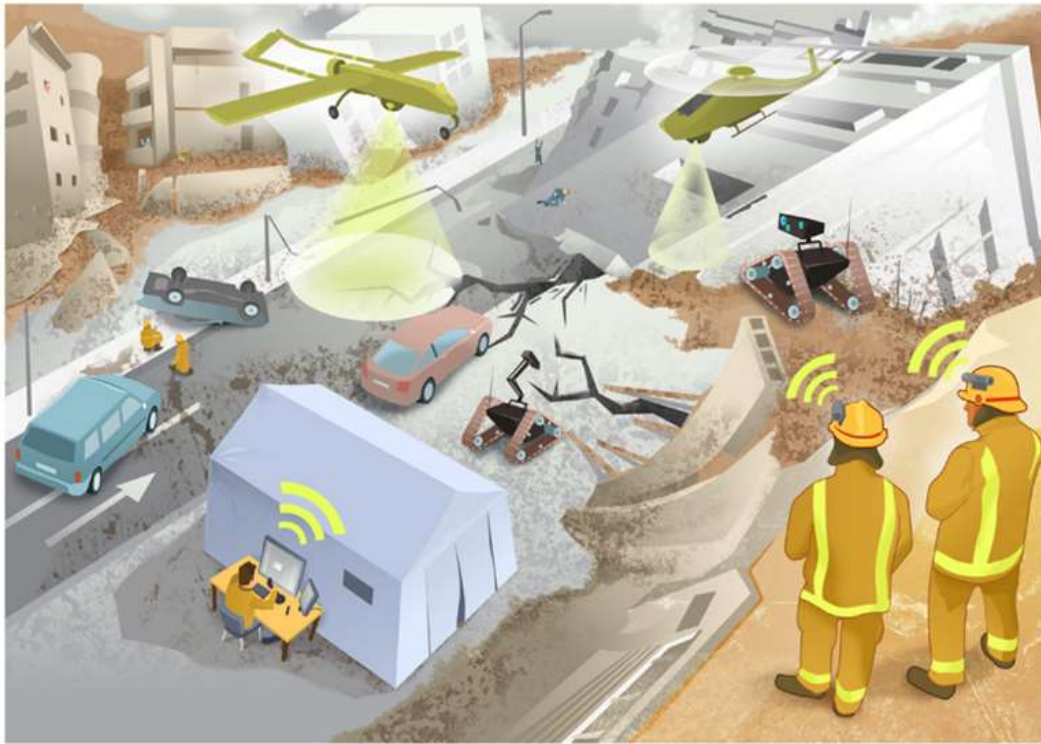
Figure 3: Artist's impression of the ICARUS land demonstration