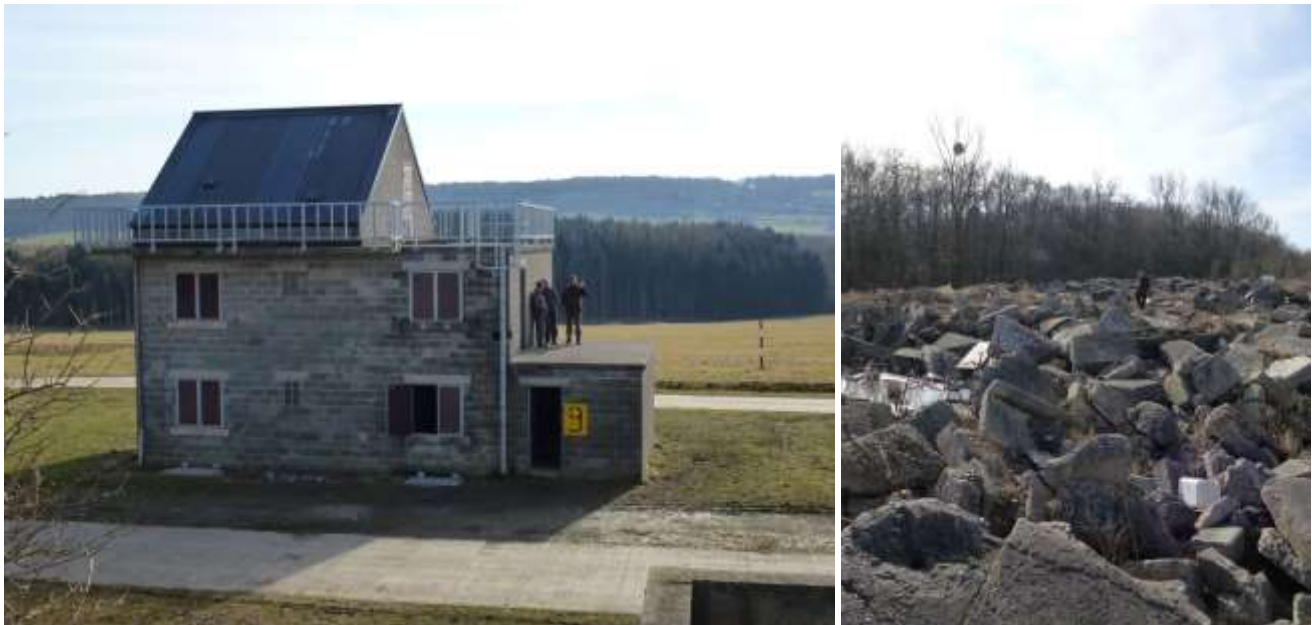
Figure 4: Pictures of the test and validation site: skeleton house for indoor operations and rubble field for outdoor mobility operations